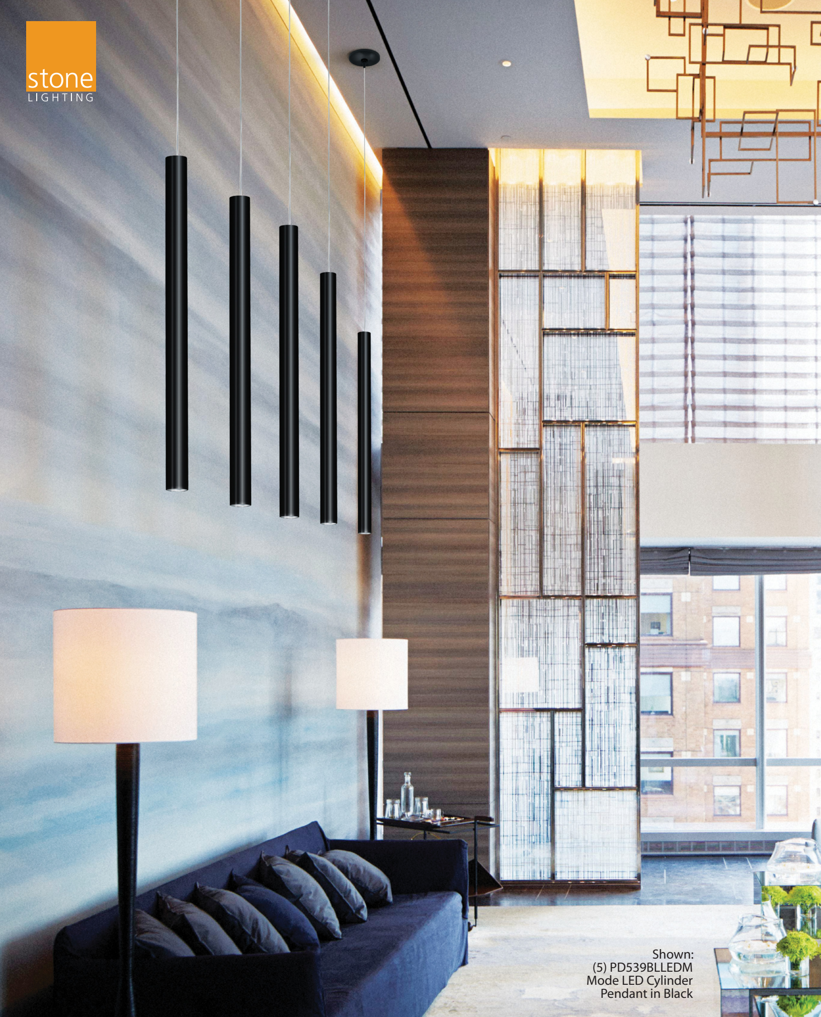
Shown: (5) PD539BLED Mode LED Cylinder Pendant in Black